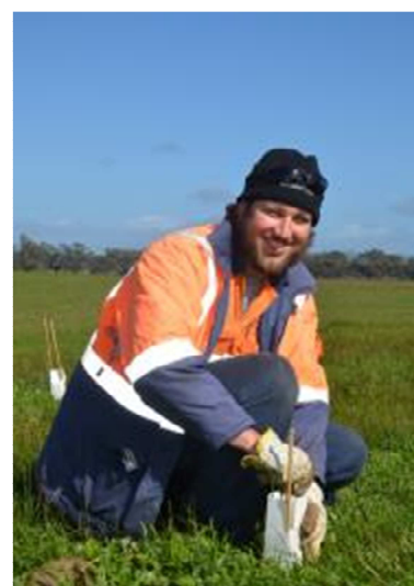
Wycheproof crew tree planting day

Those employed under the program will work as part of a work crew on jobs such as weed and rabbit control works, watering revegetation sites, fencing native vegetation, improving soil health, GPS mapping of weeds and revegetation.