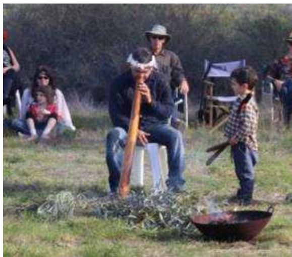
Campfire & Culture field day.

A new law safeguards the intangible assets, such as story, songs and dance of Victorian Traditional Owners.